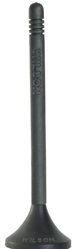
shown actual size

For more info on this product visit www.wilsoncellular.com