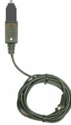
12V DC Power Supply (Cig. Lighter Plug Included)