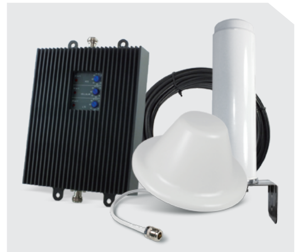
The SureCall TriFlex-T kit featuring the Omni and dome antennas.